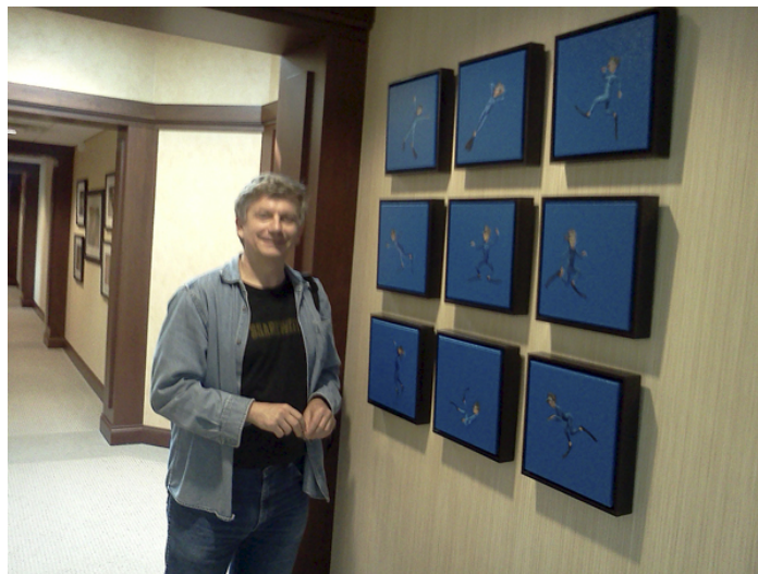
Calligram of frog #1 to # 9, 2005, priv.coll. Hilliard, OH

An interactive picture, combining several canvasses, let the collector to create his own artwork where he can dive in.