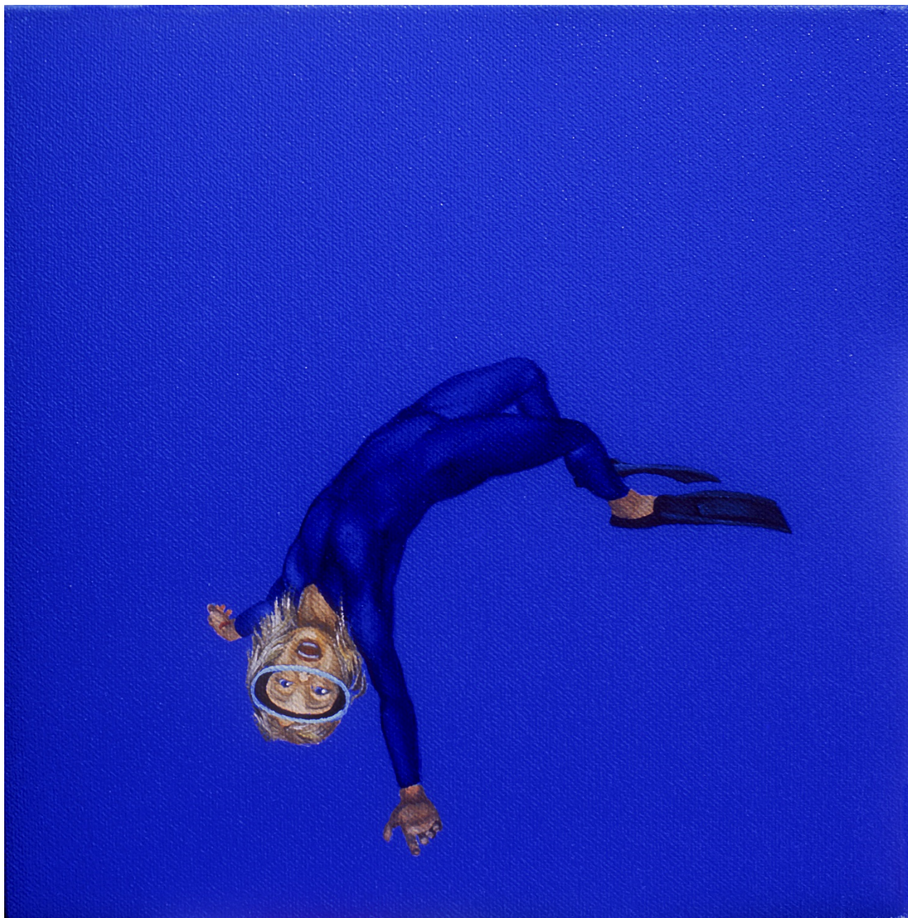
CALLIGRAMME DE GRENOUILLE 30 / Calligram of Frog #30

10×10 oil on canvas gallery wrap signed on the lower right edge